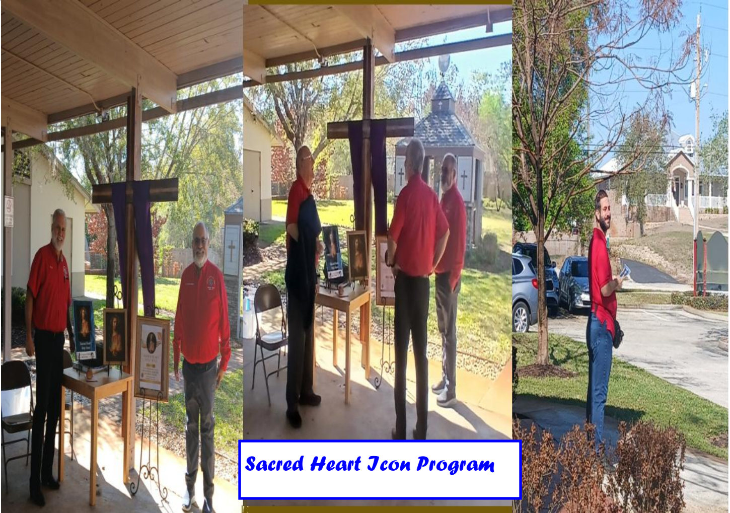
Sacred Heart Icon Program