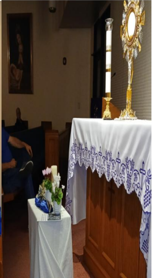
Silver Rose Program March 3rd