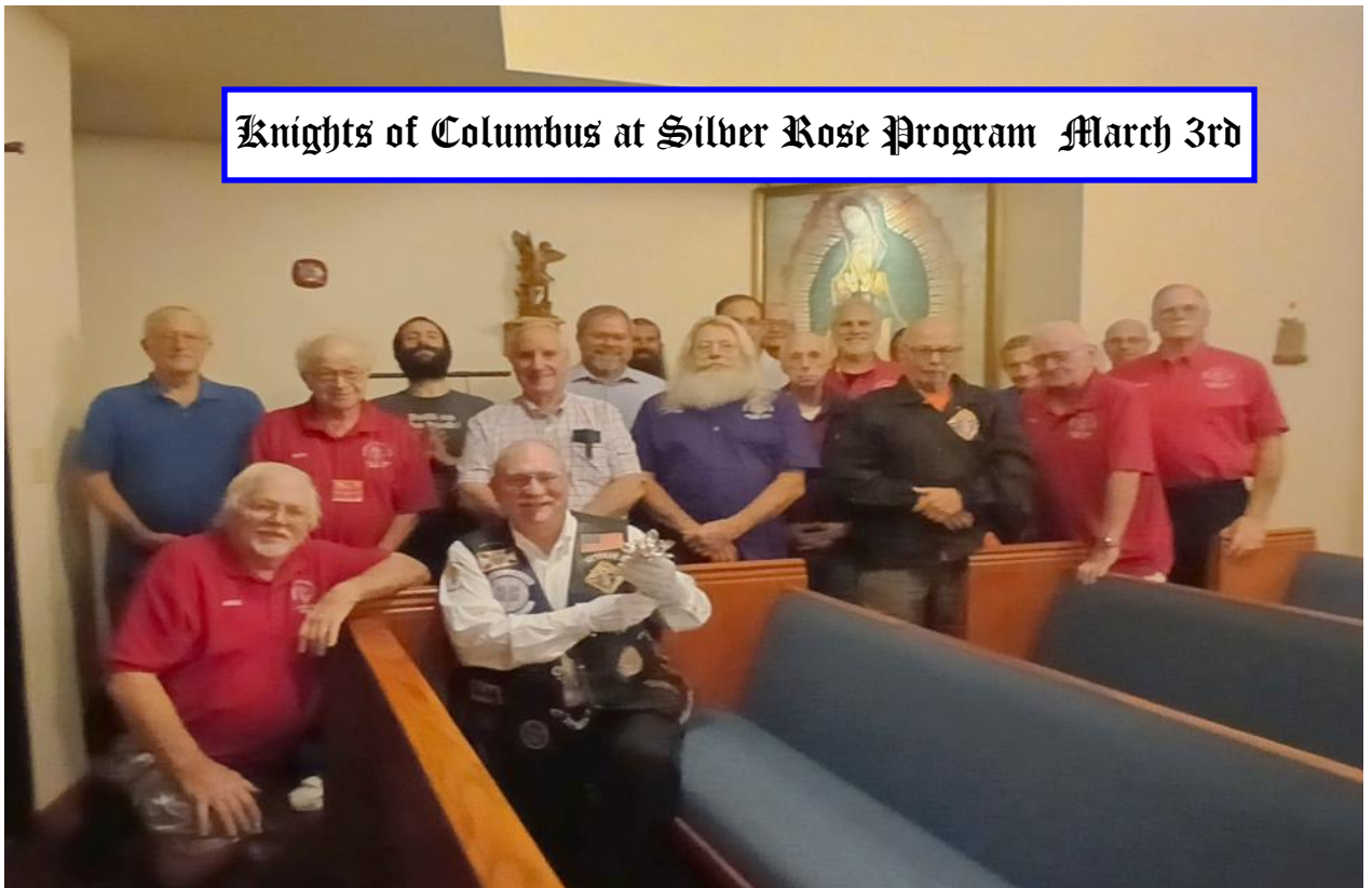
Knights of Columbus at Silber Rose Program March 3rd